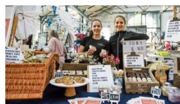
St George's Market